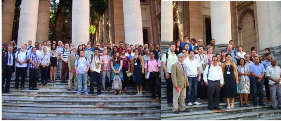
A view of the participants on the opening address at the Matemática y Computación Faculty entrance

The Welcome party took place at Salón Internacional, Hotel Habana Riviera, where the participants gathered after the opening conference. The conference dinner was organized at the cabaret Copa Room, where the dinner was completed with a show where Cuban dancing was performed by a ballet company accompanied by the songs performed by singers. It was cheerfully closed with Salsa dancing of delegates and dancers of the ballet.